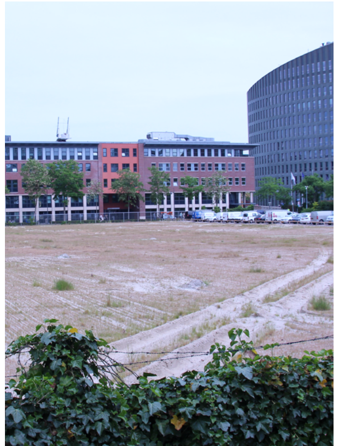
The Education Boulevard will appear here in the future.

"The roles and the specific documentation come back with each project, so that's why we can use our template again and again. The big advantage of Bricsys 24/7 is that we pay a fixed amount per year, regardless of the number of users. That is why it is very easy for us to give external companies access to our environment. With the role-based access rights, we have ensured that everyone can only view those documents that are intended for him or her."